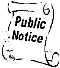
Table of Clean Water Act Civil Penalty Order Public Notices (Posted below are penalties that have been publically noticed i

Home | EPA Home | Region 7 | Laws & Regulations | Clean Water Act Public Notices Table of Clean Water Act NPDES Storm Water Public Notices